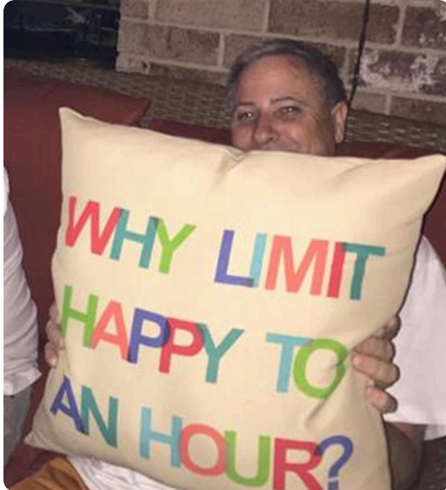
The pillow says it all .. Why limit happy to 1 hour ...